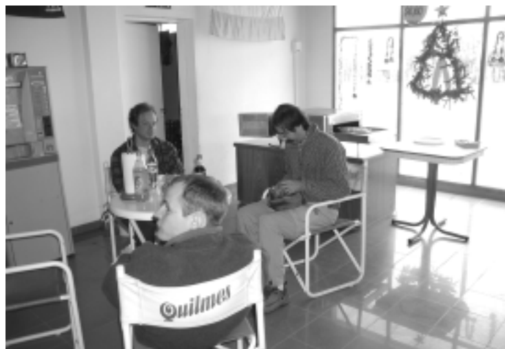
Christmas dinner on the road in Argentina.