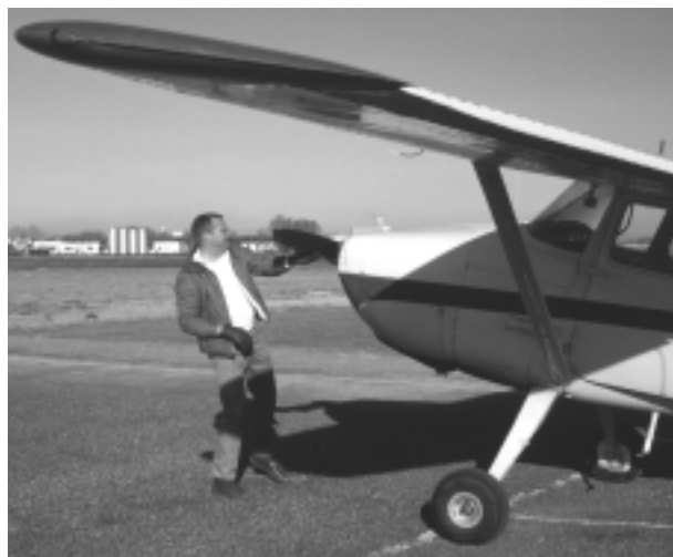
Preflighting N2398D.

This photo was taken at the Burley, Idaho, airport on the morning of April 14, 1966 by Charles F. Mansfield (one of our grad students) during a preflight check of the department’s Cessna 170B (a four-place all metal airplane with conventional landing gear; i.e. with a tail wheel). It was called N2398D, which was its registration number. A preflight check is done simply to see that everything is OK before taking off. It consists of checking to see that all the parts are fastened on securely, that the oil and gas tanks are filled and properly secured. One usually