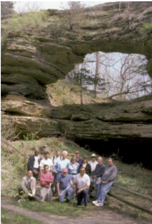
Members of the Board of Visitors joined department faculty, students, and guests on a field trip to the Baraboo area May 4, 2002. This photo was taken at Natural Bridge State Park.

This proposal requests $2,000,000 from NSF and NIH, and is possible because of matching commitments of $450,000 of endowment funds from the Department of Geology and Geophysics, and $450,000 from the Graduate School. The College of Letters and Science has allocated new salary for the director of this facility. If successful, WISC-SIMS will be located in approximately 1500 sq. ft. of newly renovated space in the basement of Weeks Hall (figure left), which can be made available because of the new west-wing addition (see p. 5).