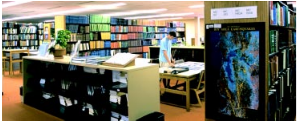
The Geology Library.

Finally, it has been a very busy year working on the design of the new Weeks West Wing addition.