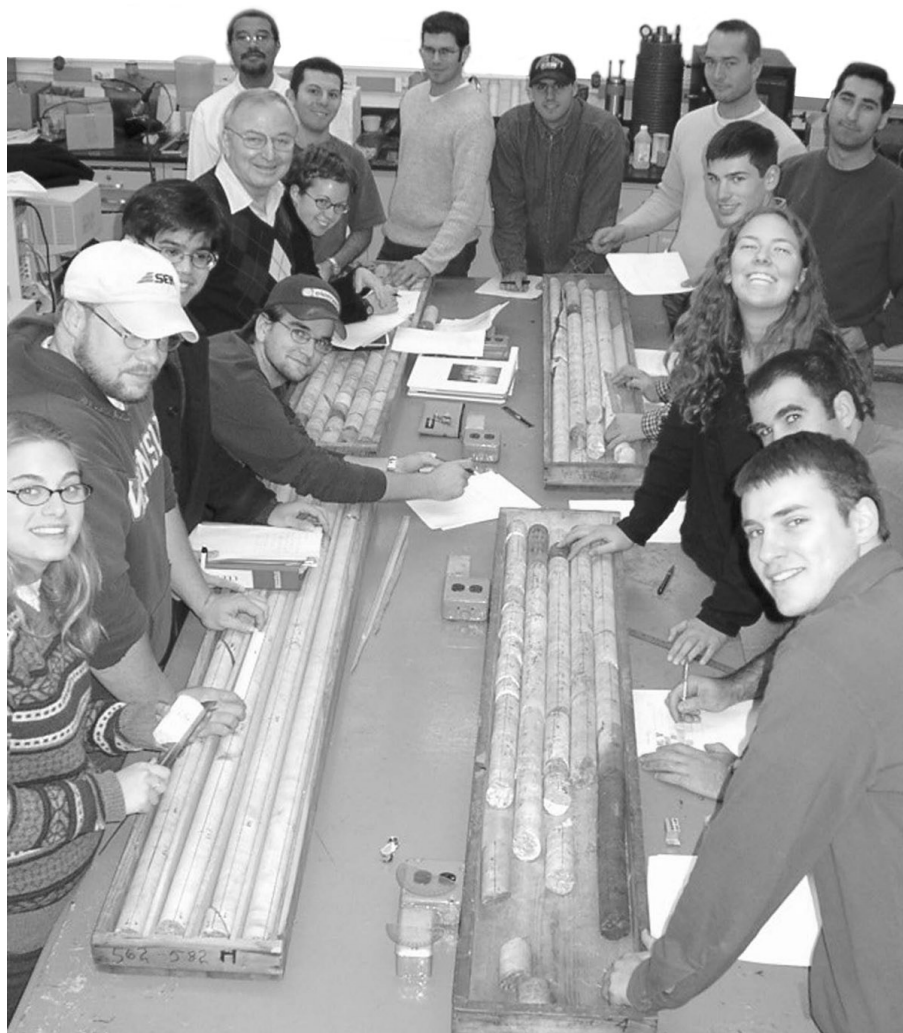
Students in GLE 476, Geological Engineering Field Methods, examine rock core samples.

The GLEs would like to extend a sincere thank you to Polygon for these rewarding, educational experiences. Without Polygon's funding, we would not have been able to develop so many new personal and professional relationships with fellow engineering geologists. And of course, thank you to the alumni and faculty who brought about our AEG affiliation.